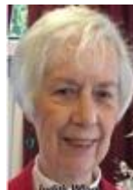
Providence Point Judith Wing VP-Elect